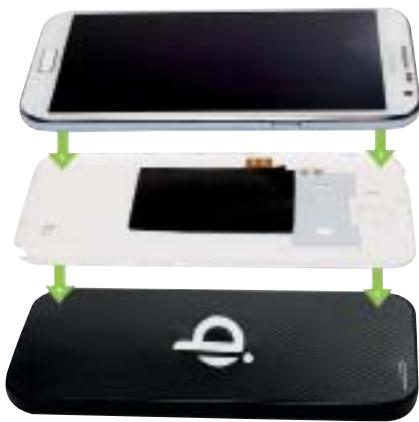
Simply place and charge