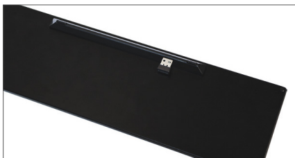
Keyboard with magnet stand and dongle